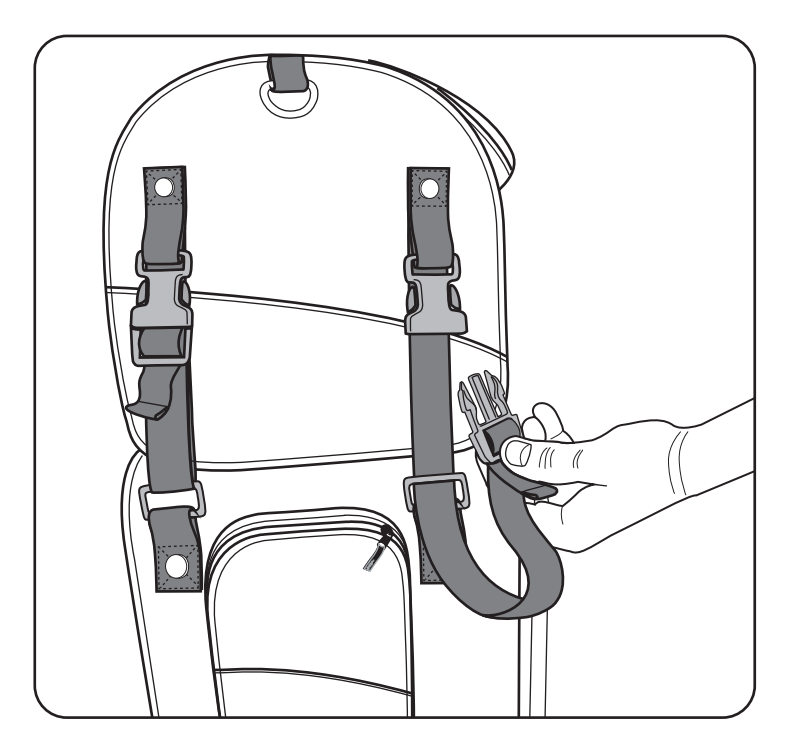
Place the NR-210 Day trip bag on top of the Highway roller making sure the bag is centered and laying flat. Use mounting straps on both sides of Day Trip bag and the square rings on Highway Roller to connect the two bags. Pass the strap with the male buckle through the square ring and reconnect with the female buckle attached to the NR-210 Day Trip. Make sure the male buckle clicks when inserted. Repeat on all 4 straps on the bag.

included waterproof rain cover to protect your bag. After the bag is completely covered and the bottom bungee wraps around under the bag, secure the rain cover using the side attachment straps. Pass the strap with the male buckle around the luggage rack or frame, lift the rain cover flap and insert the buckle through the slot and reconnect into female buckle under the cover. Fasten the cover flap closed. Repeat on all 4 straps on the bag.