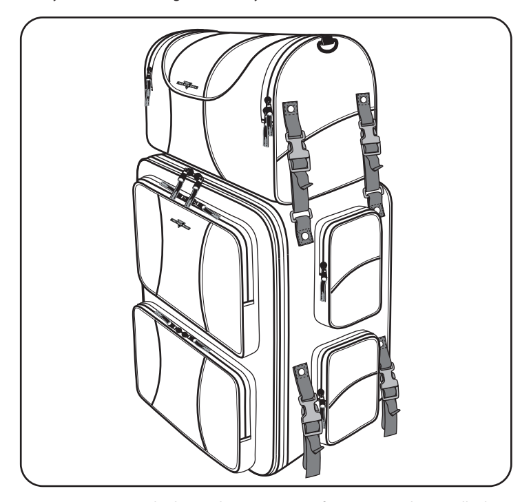
NR-210 Day Trip can also be used as a top mount for NR-200 Highway Roller bag. See next picture for mounting instructions.

With bag sitting on a luggage rack or passenger seat, loosen self fastening straps. With straps passing through "D" ring, slide over your backrest. Pull to tighten and lay the strap back onto itself, connecting the self fastening straps. For the side attachments pass the strap with the male buckle around the luggage rack or frame and reconnect with the female buckle attached to the bag. Make sure the male buckle clicks into place. Repeat this on all 4 straps on the bag. Make sure the bag has little if any movement up, down or left and right before riding. Always recheck mounting before every ride.