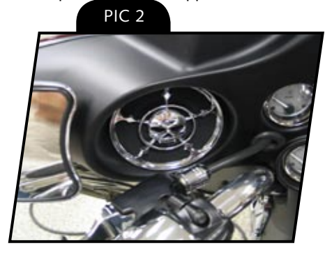
STEP 4 Repeat process for opposite side.

ATTENTION! The adhesive will not bond correctly if applied at temperatures less than 50°F. Do not attempt this installation in temperatures less than 50°F.